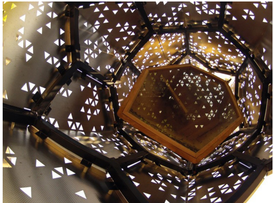
Figure 5 and 6: Public children’s event at Silo City.